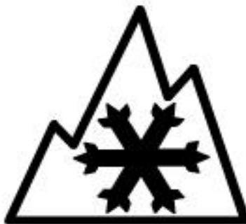
Severe winter traction icon

NOTE: Some newer tires are designed for use in severe snow conditions and are marked on at least one sidewall with the letters "M" and "S" (e.g., MS, M/S, M&S, M+S, etc.) plus have a pictograph of a mountain with a snowflake. If you need more information on tires designed for severe snow conditions contact the CTQP Administrator (at (810) 677-5745) or refer to Rubber Manufacturers Association, Tire Information Service Bulletin, Volume 37, Number 2, February 1999 and titled "RMA Definition for Passenger and Light Truck Tires for Use in Severe Snow Conditions." An example of the mountain/snowflake is shown below.